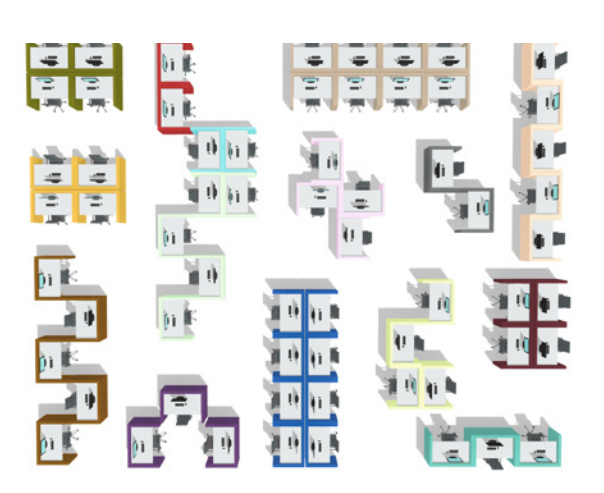
HILO enables and inspires creative planning of open offices.

Production takes place at some of Sweden's and Europe's leading furniture factories with environmentally sustainable production as a common denominator.