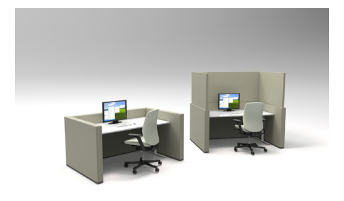
HILO model 1400