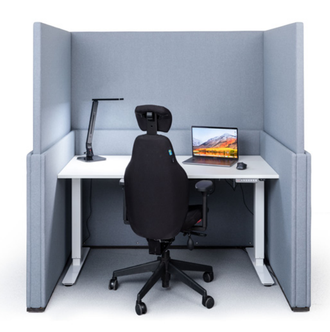
HILO model 1400 - high position (165 cm).