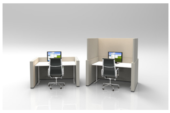
HILO model 1200