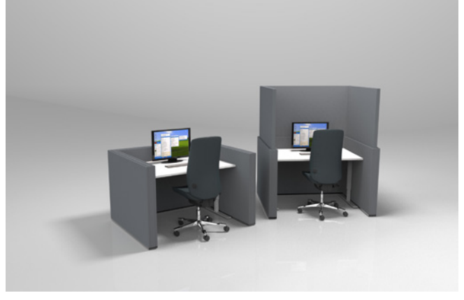
HILO model 1000