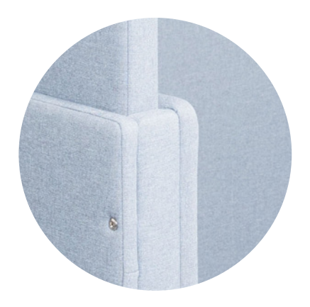
When lowered, the HILO adjustable screen hides in the equally sound-absorbing base structure.

out the room. With 20 mm A-rated absorbent material of reused pet bottles on both sides of a 6 mm core of wood, HILO is both an efficient sound absorbent and a sound screen. The sound absorption according to ISO 354 test is outstanding. See our web site for full test results.