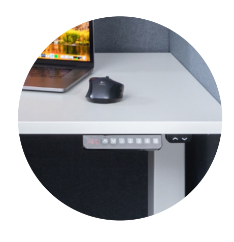
From open to fully screened at the touch of a button.