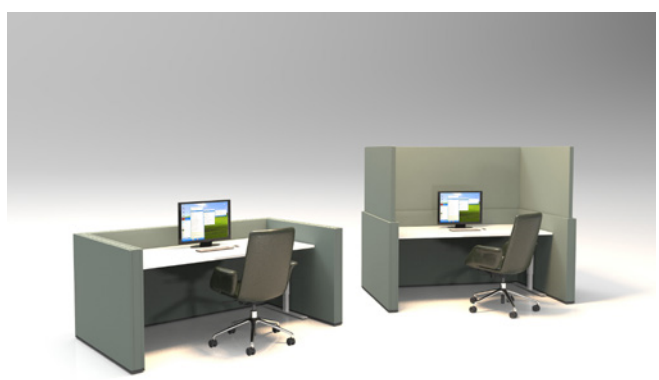
HILO model 1600