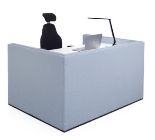
Interaction or concentration? With the HILO cubicle, you can quickly and steplessly change between openness and privacy.